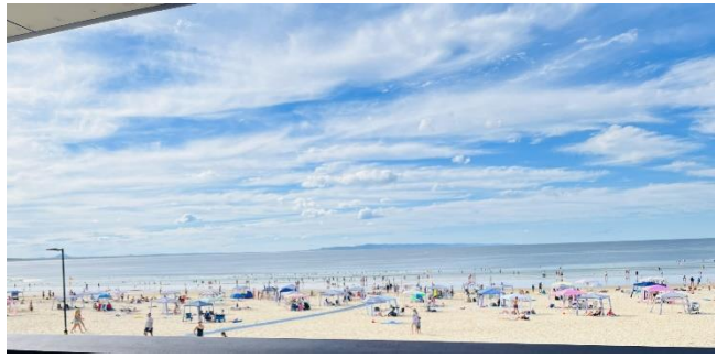
Noosa Main Beach (Sunshine Coast)