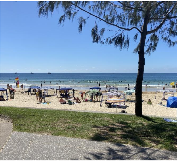
Mooloolaba Main Beach (Sunshine Coast)