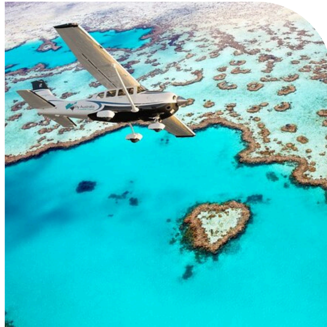
Airlie Beach and Whitsunday Islands, 2 hour drive from Mackay.