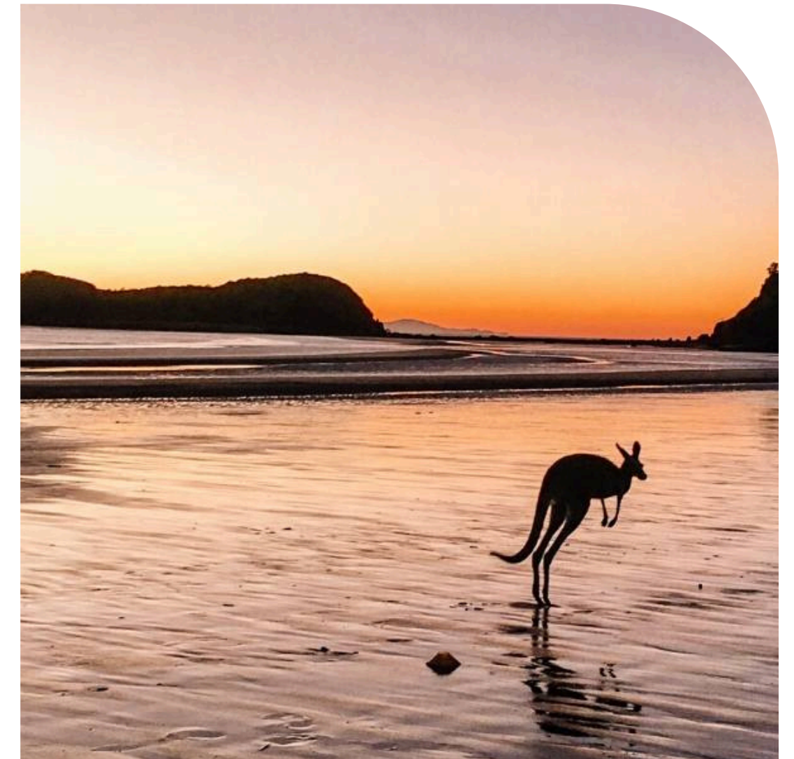
Beautiful National Parks, beaches and hinterland to explore.