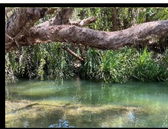
“The Gregory River”