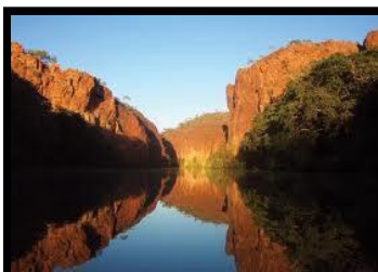
“Lawn Hill Gorge”