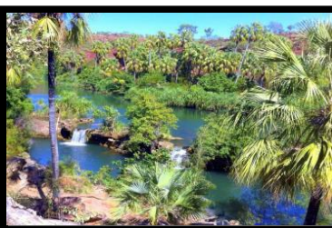
“Waterfalls at Lawn Hill”