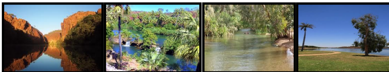
“Lawn Hill Gorge”